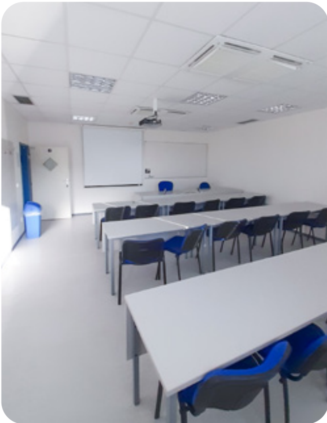
↑ Large room